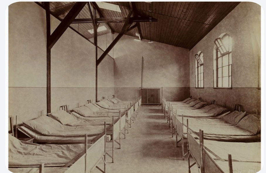
Dormitories or Hostel