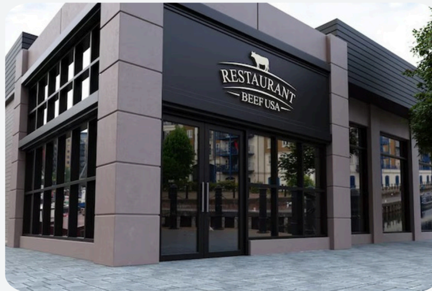
Restaurant or Cafe