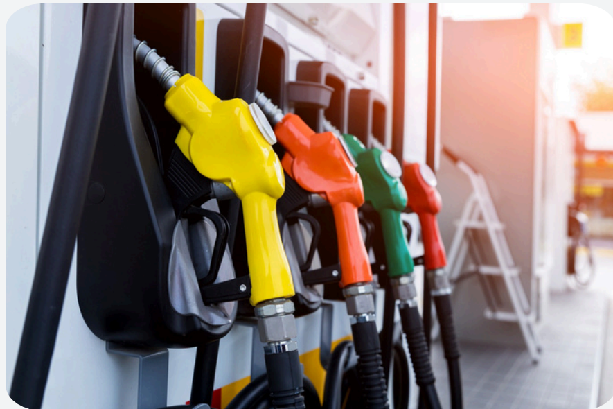
Fuel station- CNG/PNG/LPG