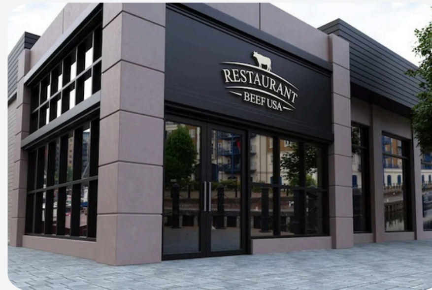
Restaurant or Cafe